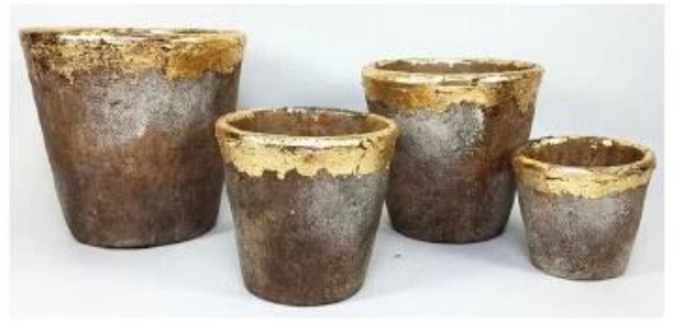
CS10025A-4 20.5x20.5x19.5cm CS10025B-4 17.5x17.5x16.5cm CS10025C-4 14.5x14.5x14cm CS10025D-4 11.5x11.5x10.5cm CS10025E-4 8x8x7cm