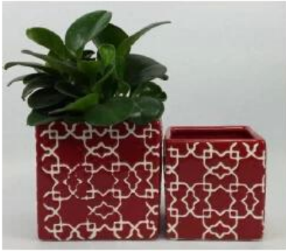
Red S16030-127 12.5×12.5×12.0cm S16030-102 10.0×10.0×10.0cm