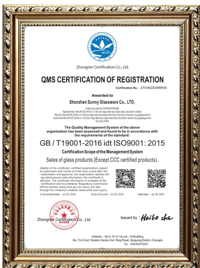
□□□□ 9001: 2015