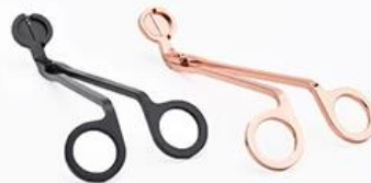
Wick Trimmer Cutter

.Adatto за семейства, хотели или градини