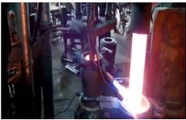
□ Machine Pressed