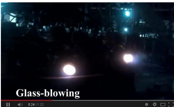
Machine blowing technology