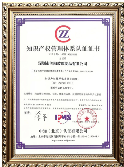
Virksomhedens intellektuelle ejendomsret