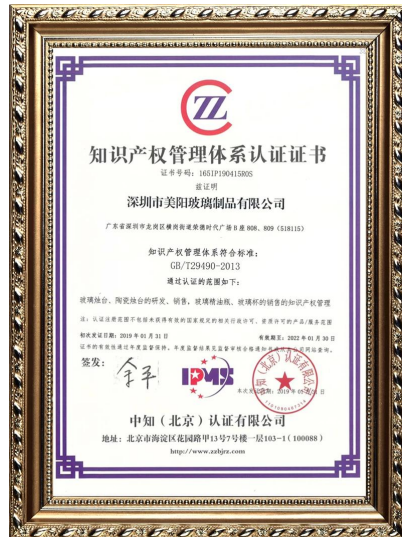
Enterprise Intellektuel Ejendom Patentnr.:201630655323.4