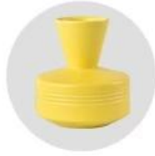
Solid color glaze