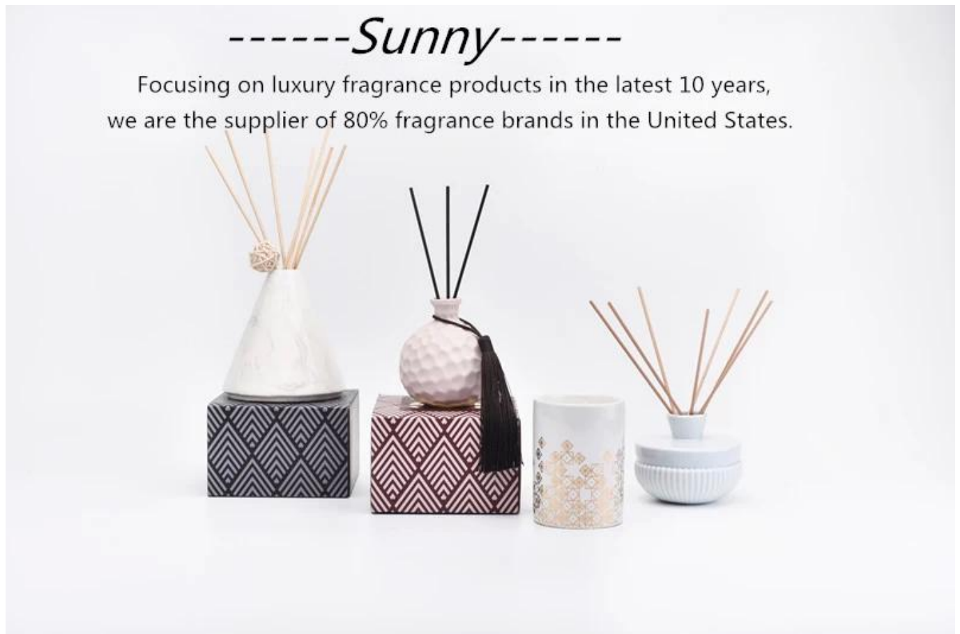
Sample of the glassware UNNY

We want your ideas to become creative fragrance products and sell them very well in the local market.