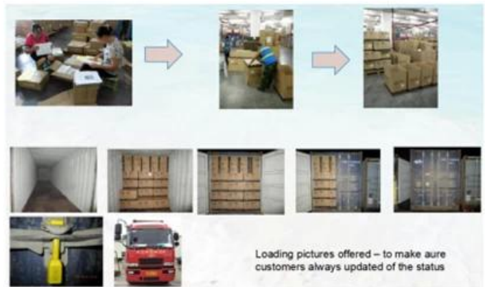
Packing & Loading