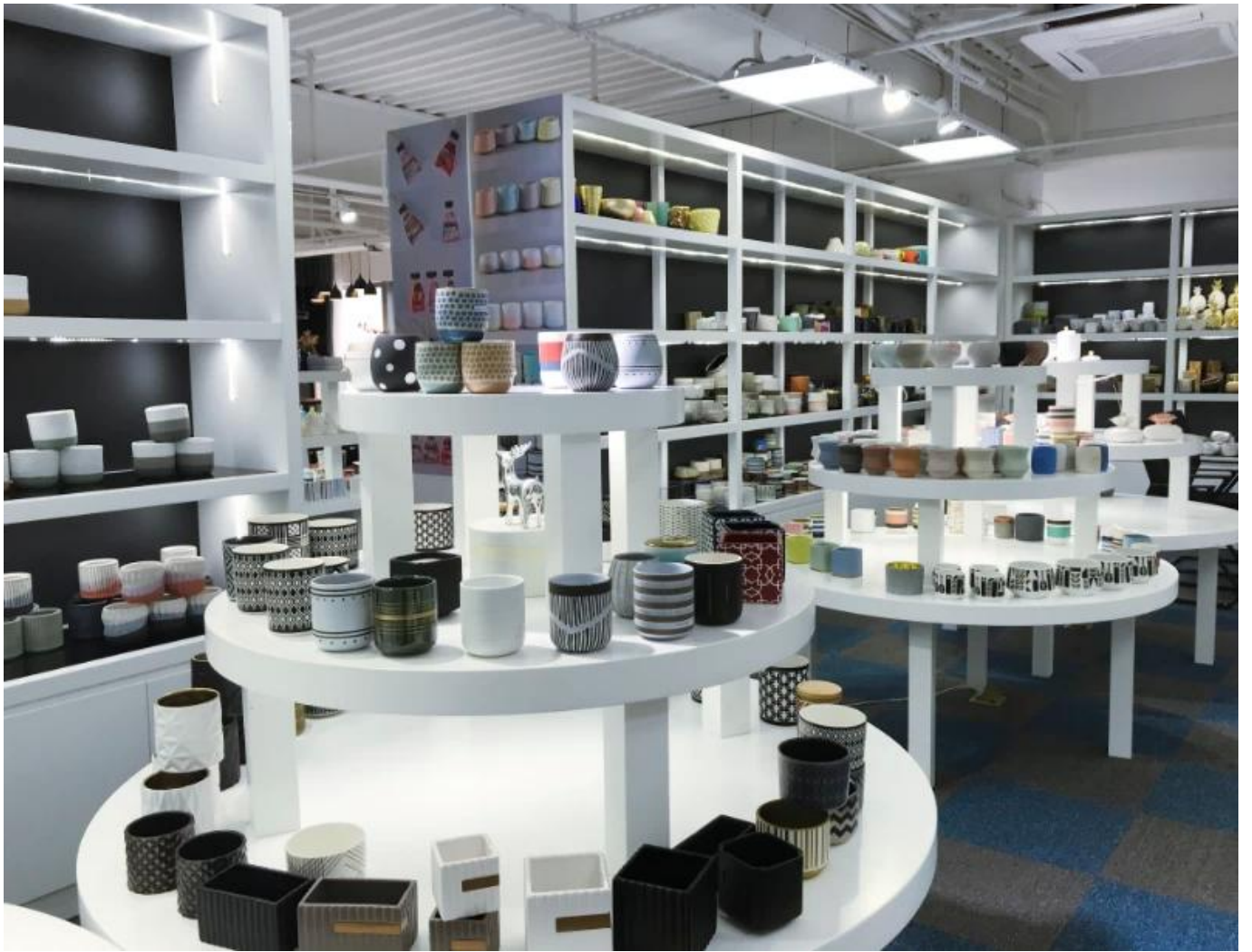
Imágenes de Roduct