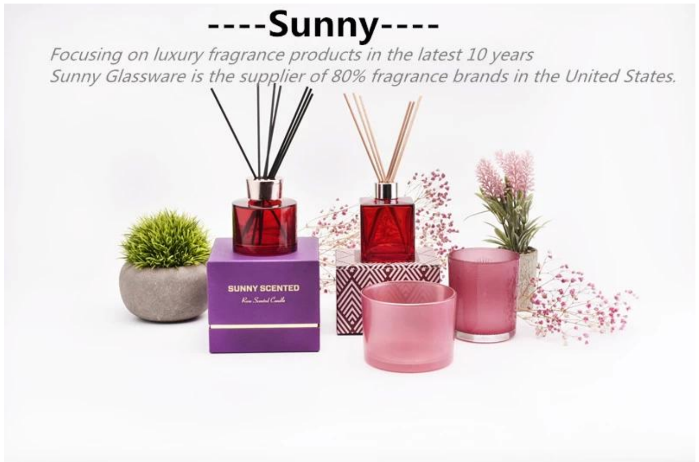
Sample of the crystalware UNNY

We make your ideas become creative fragrance products and sell them very well in the local market.