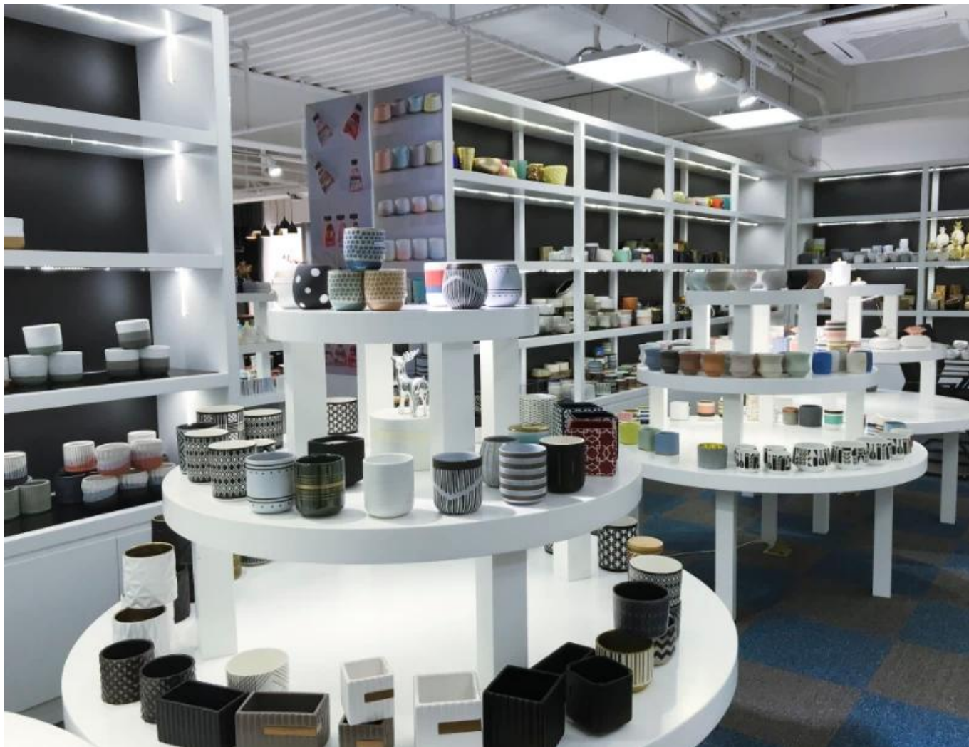
Pimages de produit