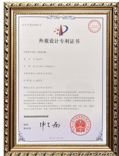
Brevet n °: 201630655323.4