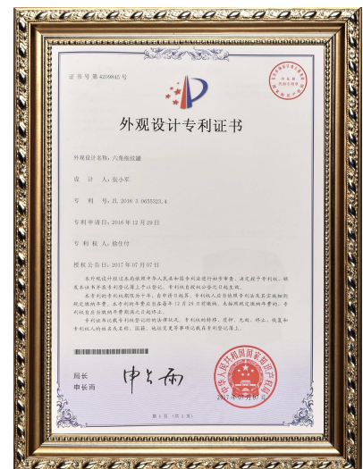
Broj patenta: 201630655323.4