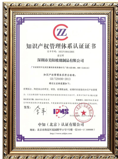
Enterprise Intellectual Property Patent Br.:201630655323.4