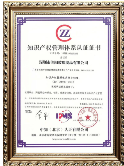
Enterprise Intellectual Property Patent Br.:201630655323.4