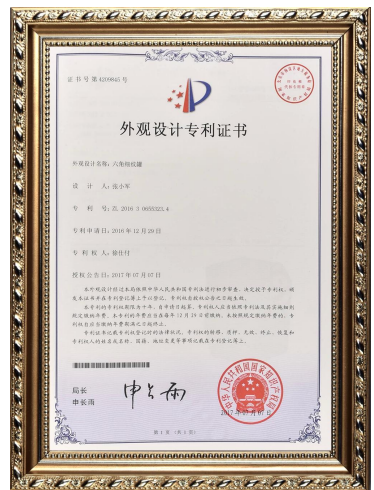
ISO 9001:2015 &Perusahaan;&Intelektual&tawon;Properti Paten No.:201630655323.4