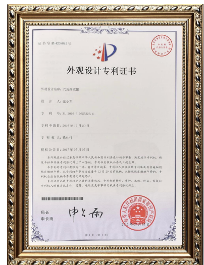
Nomor paten: 201630655323.4