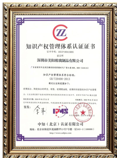
Kekayaan intelektual perusahaan