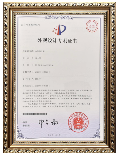
ISO 9001:2015 & Perusahaan; & Intelktual & tawon; Properti Paten No.: 201630655323.4