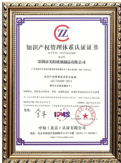
Kekayaan Intelektual Perusahaan