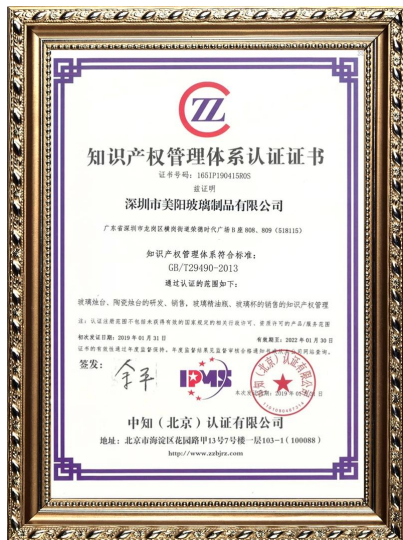
Kekayaan Intelektual Perusahaan