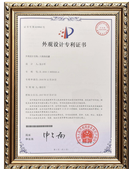
Paitinn & ensp; Uimh.: 201630655323.4