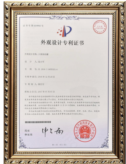
Paitinn Uimh.: 201630655323.4