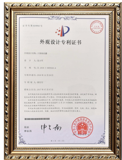
Uimhir paitinne: 201630655323.4