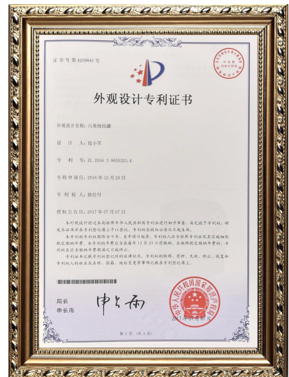
Patinn Uimh.: 201630655323.4