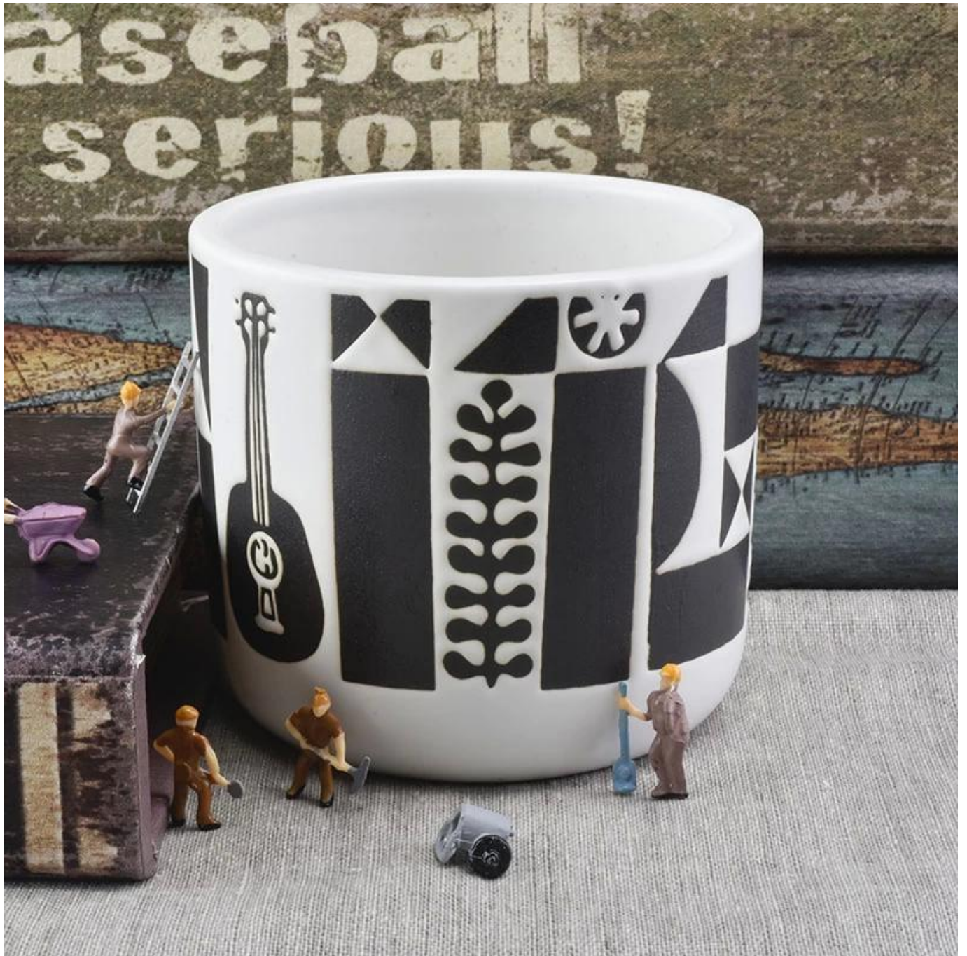
Office & Sample Room