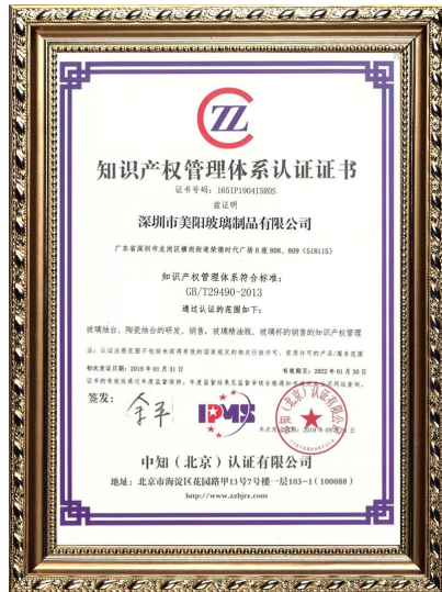
Enterprise Intellectual Property Patent No.:201630655323.4