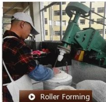
▶ Roller Forming