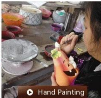
▶ Hand Painting