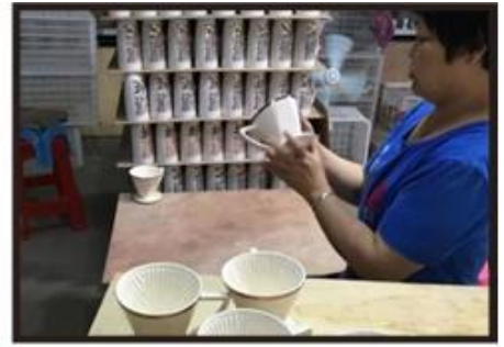
Inspection the decal product