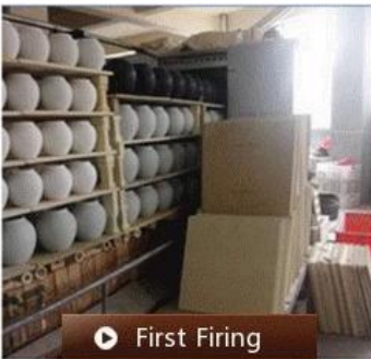
▶ First Firing