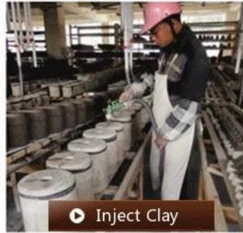
▶ Inject Clay