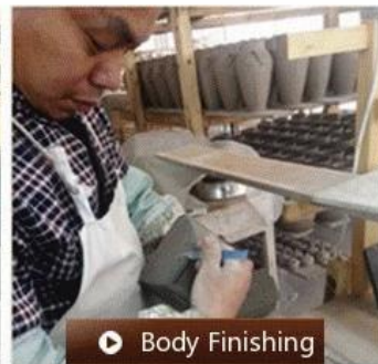
▶ Body Finishing