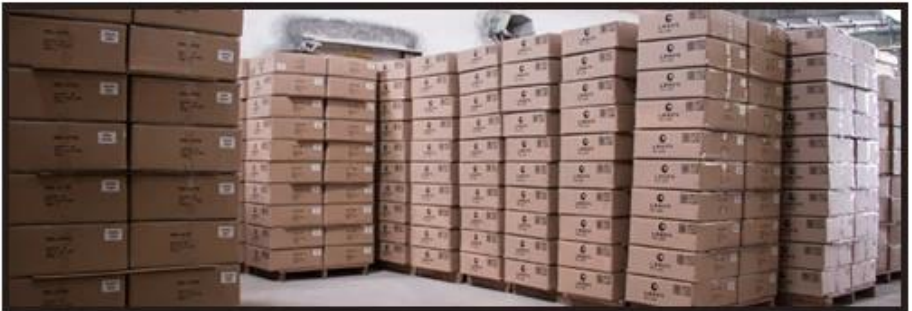
Ready to loading