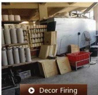
▶ Decor Firing