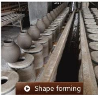
▶ Shape forming