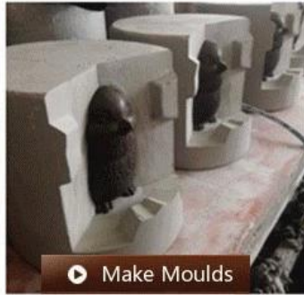
▶ Make Moulds