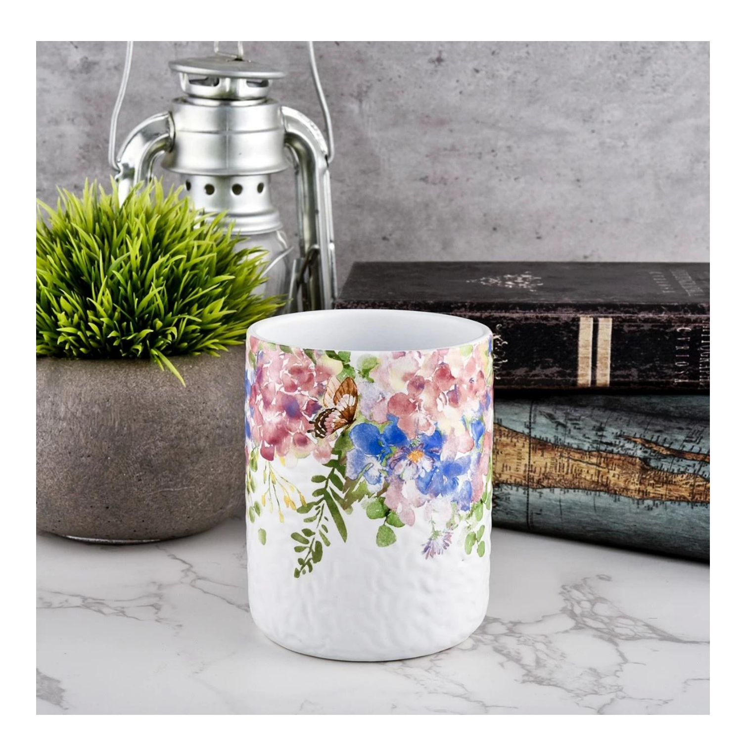
Why Choose Sunny Glassware