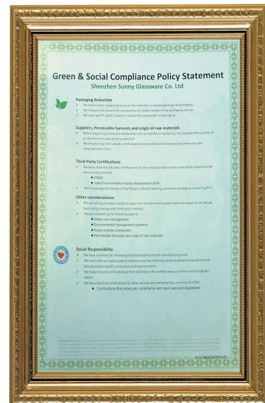
Green and social responsibility Policy's statement