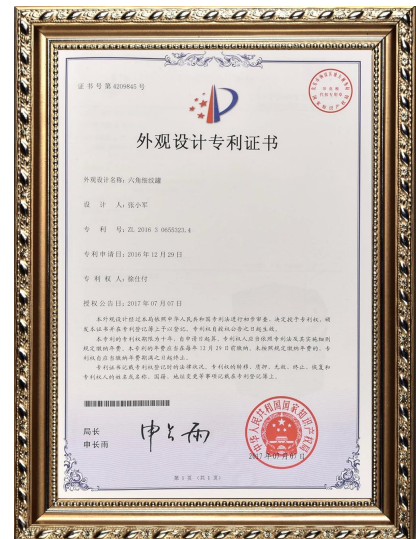
Einkaleyfi & ensp; nr: 201630655323.4