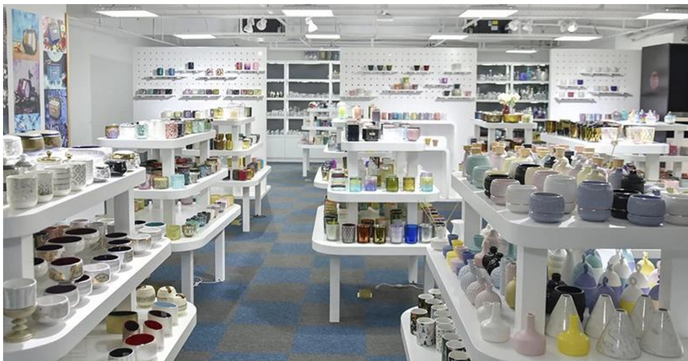
pakka AND flutninga