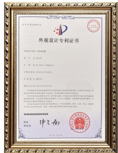
Patent No.: 201630655323.4