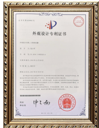
Einkaleyfi & ensp; nr: 201630655323.4