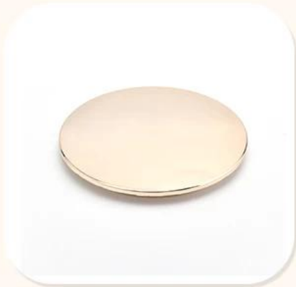
Zinc Alloy Cover