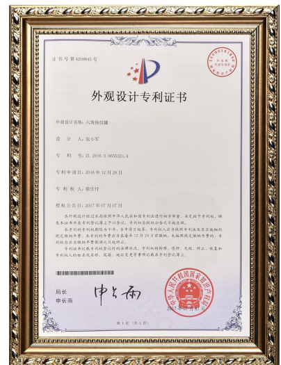
Numero di brevetto: 20163065523.4