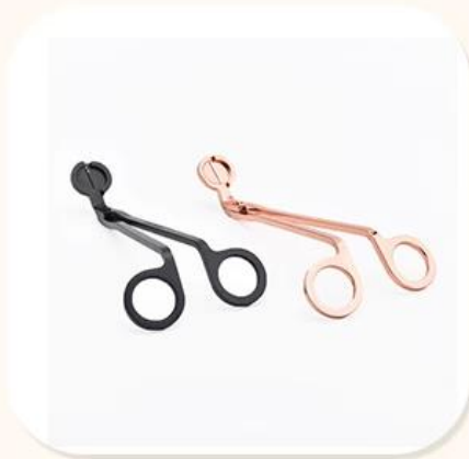
Wick Trimmer Cutter