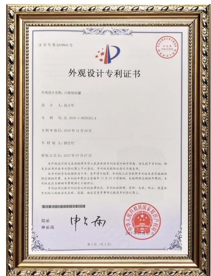
Patent No: 201630655323.4