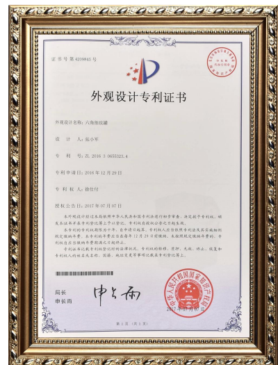
Patent No.: 201630655323.4