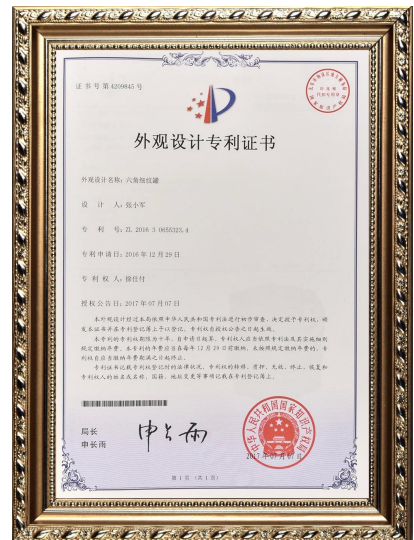
Patent No: 201630655323.4