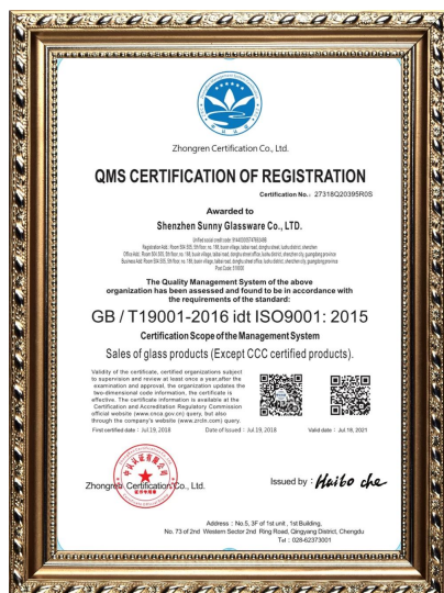
ISO 9001 : 2015