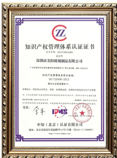
Enterprise Intellectual Property