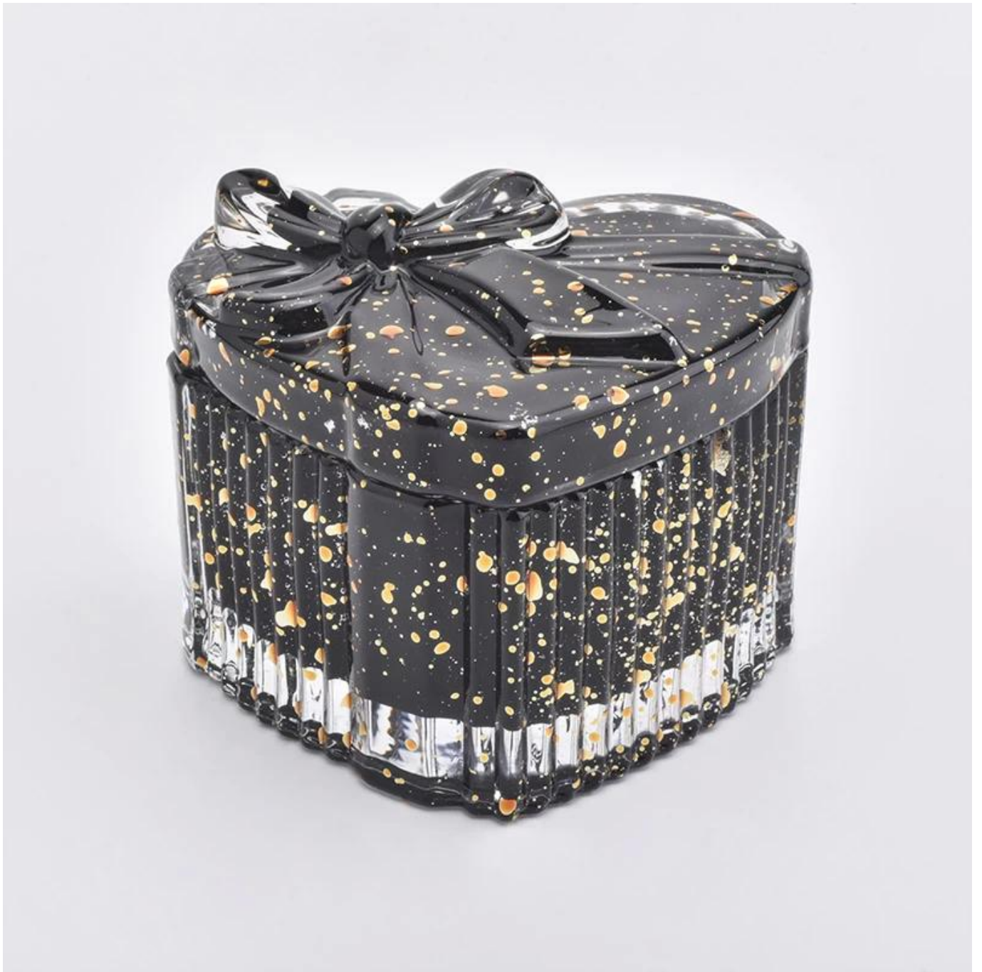
Sunny Glassware Candle ☐☐☐ ☐☐☐☐ ☐☐