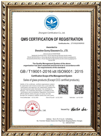
ISO 9001 : 2015