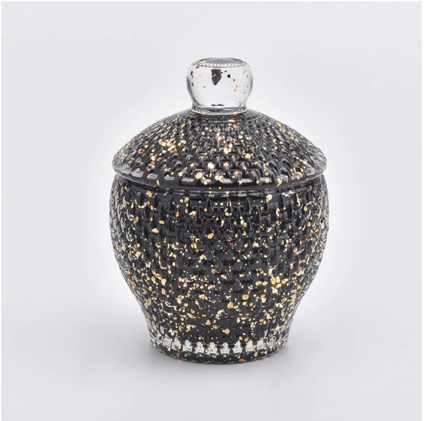
Sunny Glassware Candle