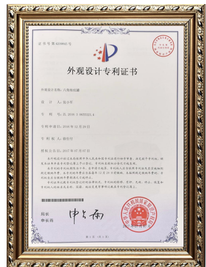
Patenta numurs: 201630655323.4