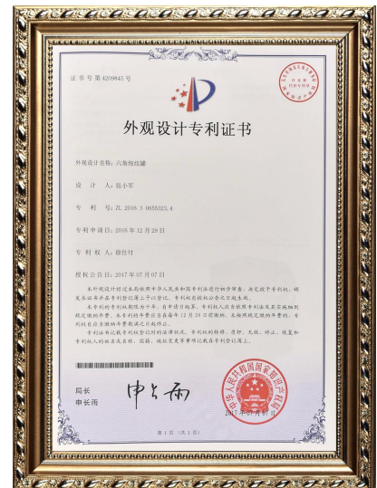
No. Paten: 201630655323.4