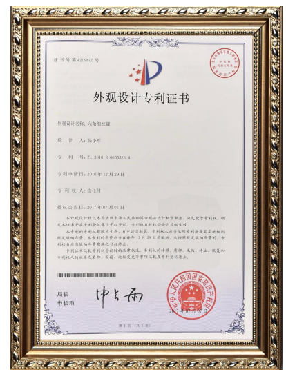
Paten & ensp;No.:20163065323.4