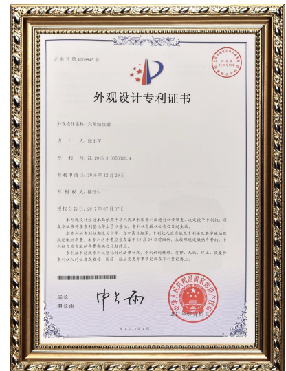
No. Paten: 20163065523.4