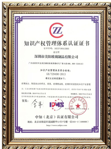
harta intelek syarikat