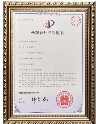
Nombor paten: 201630655323.4