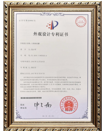
No. Paten: 201630655323.4