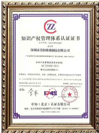
Harta Intelek Perusahaan