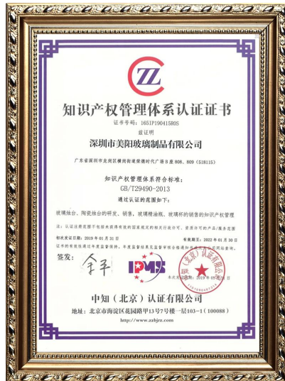
Harta Intelek Perusahaan