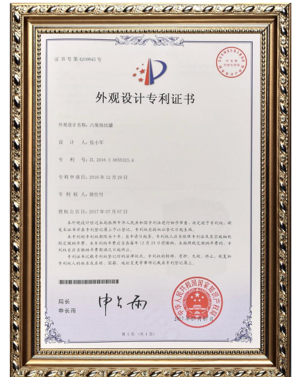
No. Paten: 20163065523.4